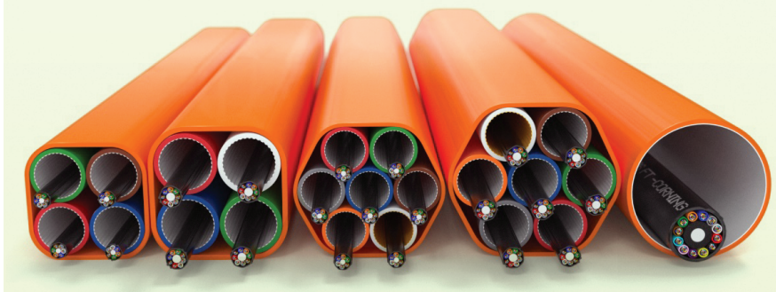
Micro cables and microducts vs. standard loose-tube cable

On the far right is a standard loose-tube cable in a 1.25-inch duct. The other images are various configurations of micro cables and microducts.