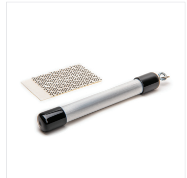
Clear Track Hallway/ILU/Quad Wall Compatibility Test Weight and Test Strips