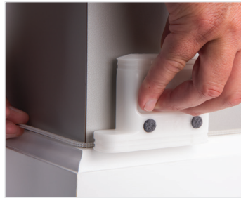
Clear Track Universal ILU Installation Tool