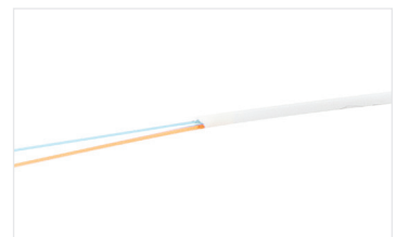
900 μm 2-Fiber Micro Module