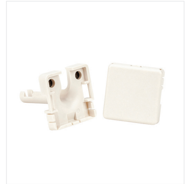
Micro Point-of-Entry Wall Cover