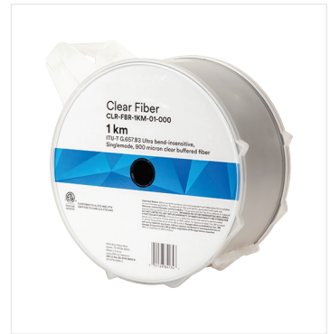
900 μm Clear Fiber, 1 km Spool ITU-T G.657.B3 Grade