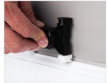
900 µm Clear Fiber into ILU Fiber Pathway with ILU Installation Tool