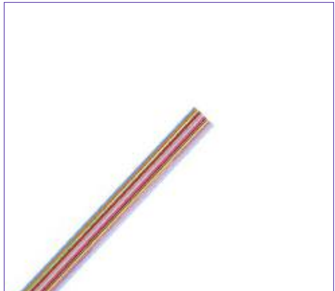
Fiber Optic Ribbon Cable | Photo CAB017