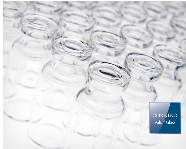
Figure 2. Valor Glass vials (Corning)

It is core to the Thermo Fisher values of Integrity, Intensity, Innovation, and Involvement that we look at and champion new capabilities such as the ultra-high speed fill/finish lines made available from companies like Optima that can use and take advantage of improved quality and operational output gained with Corning glass. “As a world leader in serving science, this allows us to stay true to our mission of enabling our customers to make the world healthier, cleaner, and safer,” stresses Closs.