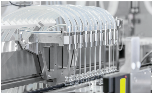
Figure 1. The vaccine is dosed multi-digit into the vials. (Optima)

One example for a successful collaboration during the pandemic is with Thermo Fisher, headquartered in Waltham, Massachusetts. The company's Pharma Services business provides contract development and manufacturing services, which includes sterile fill operations for COVID-19 vaccines and other critical care medications for pharma companies globally. As a strategic partner with the necessary technological know-how, and end to end drug substance and drug product development and manufacturing capabilities, Optima is helping the company increase capacity for vaccine filling at several of its sites as quickly as possible.